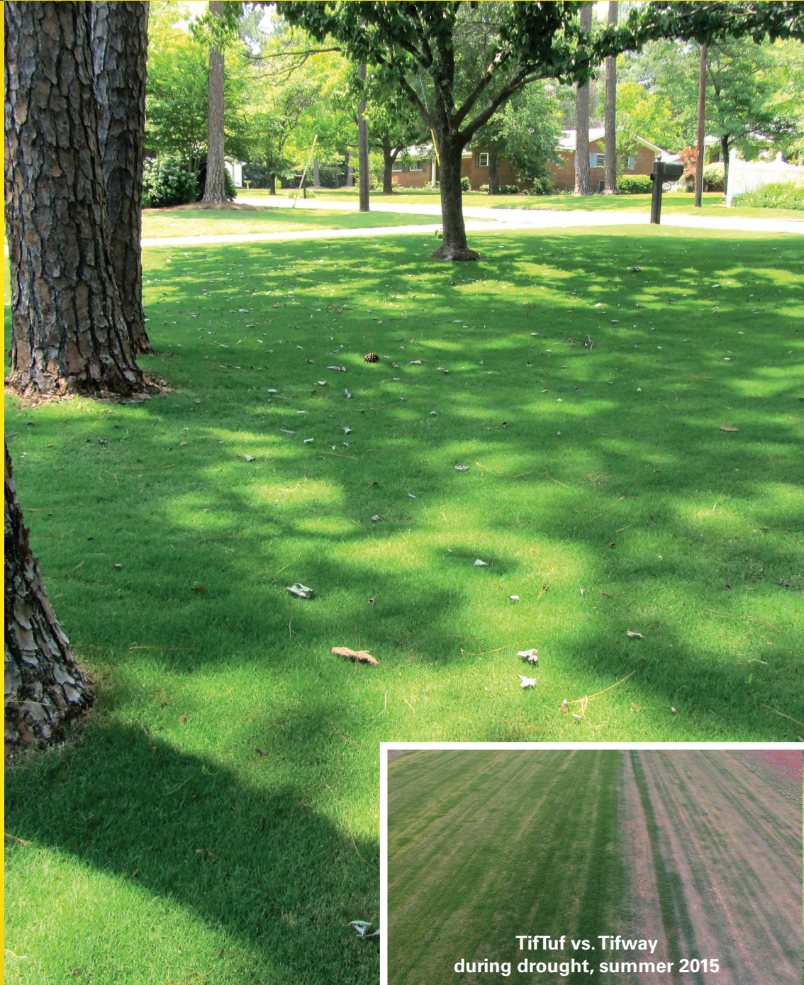
TifTuf vs. Tifway during drought, summer 2015